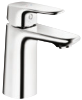
Signature Basin Mixer