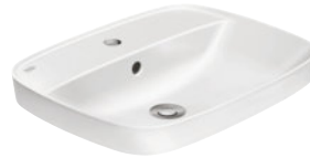
Signature Inset Basin L550 x W430 x H165mm / 1TH 43281.10