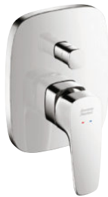
Signature Diverter Mixer