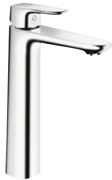
Signature Extended Height Basin Mixer