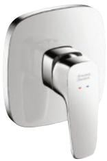
Signature Shower Mixer