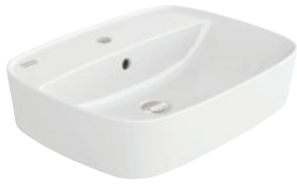
Signature Vessel Basin L550 x W430 x H168mm / 1TH 43285.10