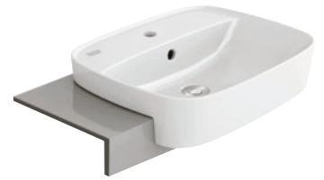
Signature Semi-Recessed Basin L550 x W430 x H170mm / 1TH 43283.10