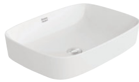
Signature Vessel Basin L550 x W400 x H144mm / NTH 43287.10