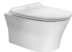
Signature Wall Hung Toilet Pan L550 x W382 x H290mm WELS 4 STAR 4.5 L per full flush / 3 L per half flush