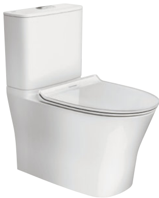
Signature CC BTW Toilet Suite L684 x W406 x H780mm WELS 4 STAR 4.5 L per full flush / 3 L per half flush Top Inlet: 15051.10 Bottom Inlet: 15050.10