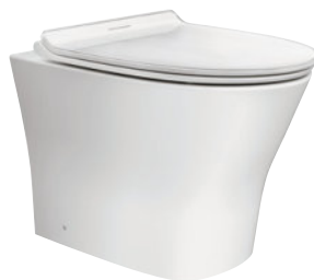
Signature BTW Toilet Pan L560 x W382 x H400mm WELS 4 STAR 4.5 L per full flush / 3 L per half flush 15052.10