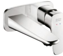
Signature Wall Mount Basin Mixer